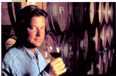
Freemark Abbey's 1997 Cabernet Bosché. "...a spectacular hit..."