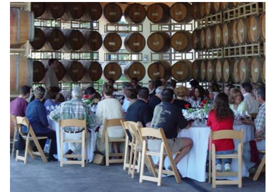
Guests enjoyed the delicious food of Kinyon Café at the Sycamore 10 Year Vertical tasting.

On a buttered sheet pan, form dough into two loaves, keeping space between because they will spread. Bake at 350° until loaves are firm. Slice diagonally with a serrated knife. Lay slices on flat sides and bake until golden brown and dry, turning once. Serve with Walnut Gorgonzola Mousse and a glass of Cabernet Sauvignon.