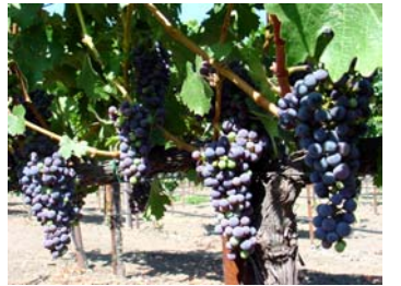
Nearly ripe Cabernet Sauvignon grapes hang on the vine at Sycamore Vineyards.

Attendees couldn't settle on a clear favorite; they were all delicious. Sycamore has great dirt! Next time you are at the winery, be sure to take advantage of our library of older Sycamore vintages. You will be drinking a special piece of Napa Valley history.