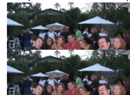
Empty glasses?! These guests need more wine...