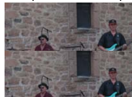
Once again, the Pulsators rock-n-rolled everyone!