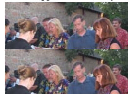
We dined on tri-tip steak and bar-b-cue chicken.